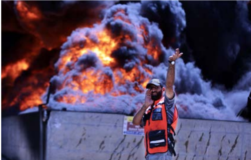
© ← The Gaza Strip's only power plant's fuel depot is seen engulfed in flames after it was hit by an Israeli air strike on 29 July 2014