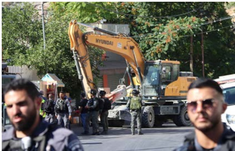
← Israeli authorities demolish a Palestinian shop in the Al-Bustan area of the Silwan neighbourhood of occupied East Jerusalem, on 29 June 2021