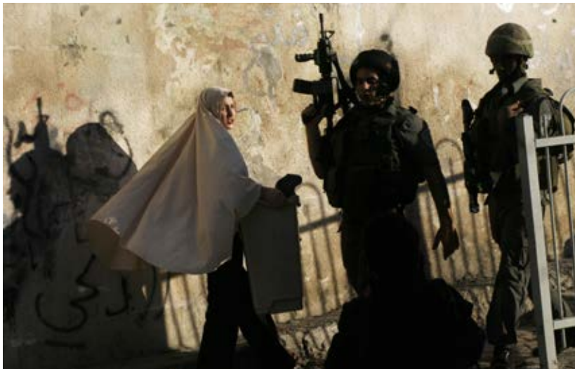
← A Palestinian woman walks past Israeli border policemen during the demolition of a Palestinian house by Jerusalem municipality workers in the Silwan neighbourhood of occupied East Jerusalem, on 5 November 2008

Jewish settlements, houses and compounds in the heart of Palestinian neighbourhoods have a disastrous impact not only on the displaced Palestinian families, but also on the entire neighbourhood and daily life of the Palestinians. Settlers are usually armed, and their compounds are fenced and protected by private security companies, which leads to friction with the local Palestinians. In several cases, these tensions have led to violent confrontations that usually end with the arrest and injury of Palestinians, including children. The settlers' control over land and property in Silwan has also led to the fencing of these sites, blocking passages that served the local Palestinian population and disrupting their lives.