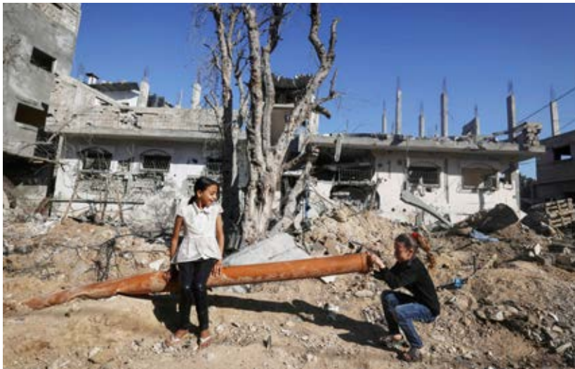
© ← Palestinian girls play next to a sewage pipe amid the rubble of damaged houses following a ceasefire between Israel and Hamas, in the city of Beit Hanun in the northern Gaza Strip on 24 May 2021 © Mahmud Hams / AFP via Getty Images