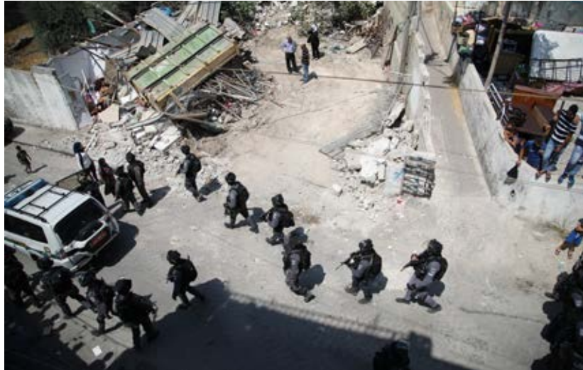
← A building belonging to Palestinians is demolished with bulldozers under the observation of Israeli forces in the Silwan neighbourhood of occupied East Jerusalem, on 15 August 2017