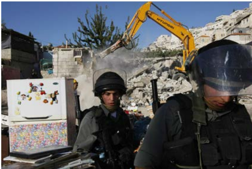
← Israeli policemen guard a bulldozer demolishing a house in the Silwan neighbourhood of occupied East Jerusalem, on 5 November 2008