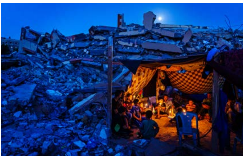
© ← Dozens of Palestinian children and family members attend a candlelit vigil on the rubble of homes destroyed by an Israeli military strike to commemorate children and other civilians killed during the 11-day conflict between Israel and Palestinian armed groups, in Gaza City in the Gaza Strip, on 25 May 2021 © Marcus Yam / Los Angeles Times